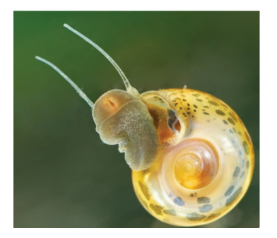
Fig. 1 Biomphalaria fresh-water snail.

www.iamat.org | info@iamat.org | Twitter@IAMAT_Travel | Facebook IAMATHealth